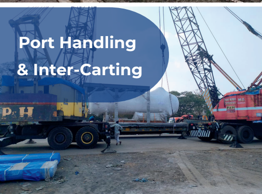
Port Handling & Inter-Carting