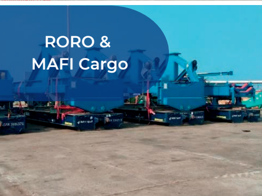
RORO & MAFI Cargo