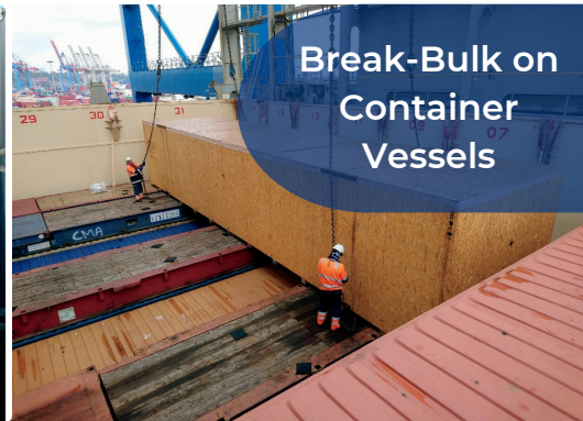
Break-Bulk on Container Vessels