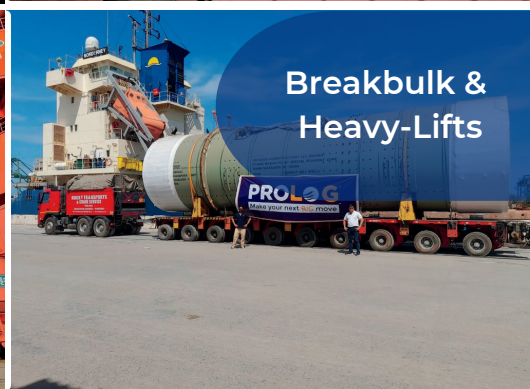
Breakbulk & Heavy-Lifts