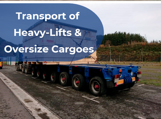
Transport of Heavy-Lifts & Oversize Cargoes