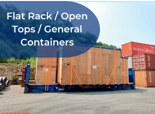
Flat Rack / Open Tops / General Containers