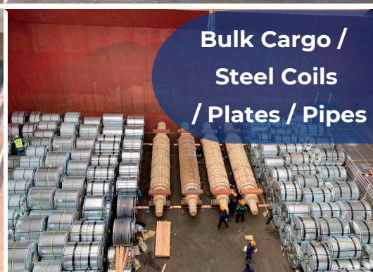
Bulk Cargo / Steel Coils / Plates / Pipes