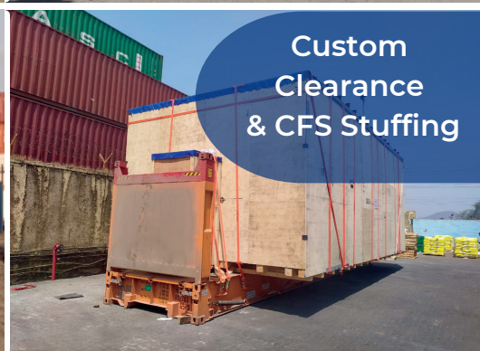
Custom Clearance & CFS Stuffing